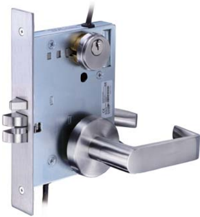
GEM800-SET with L811 Lever Option