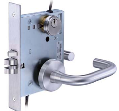
GEM800-SET with L814 Lever Option