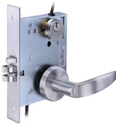
GEM800-SET with L812 Lever Option